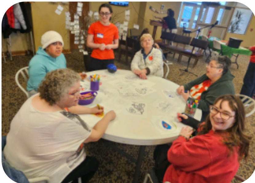
Fun at the Chiefs Party!