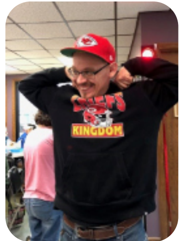
Blake's in the kingdom!