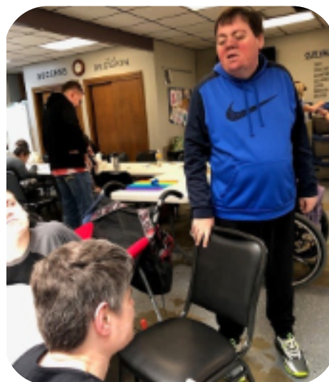
Singing to a friend!