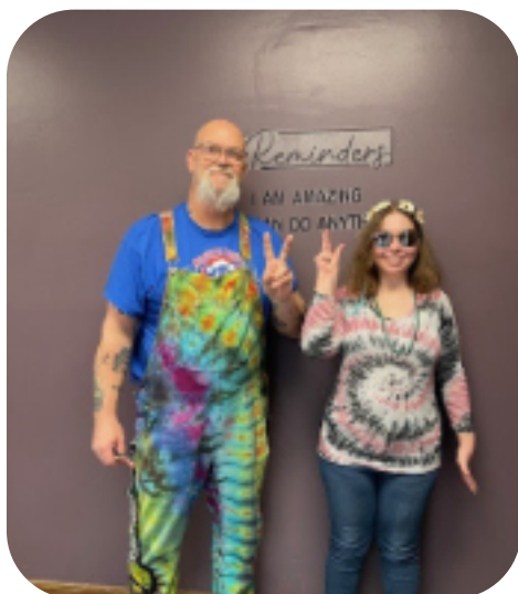
Throwback Thursday Fun!