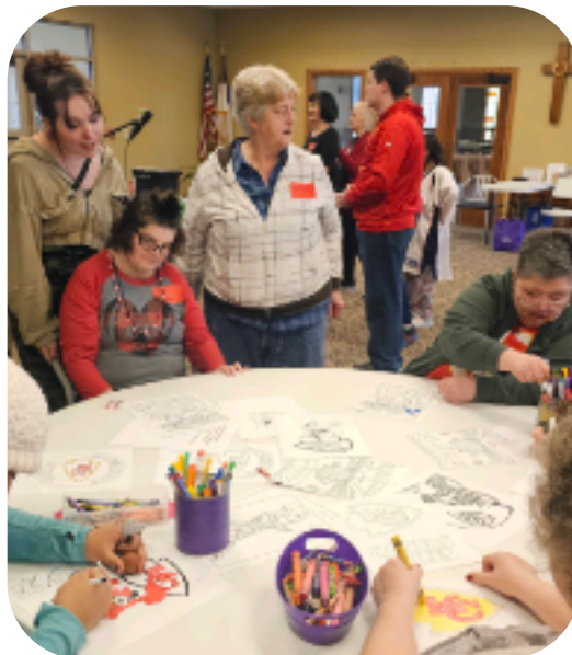
Chiefs Party at Rejoicing Spirits!