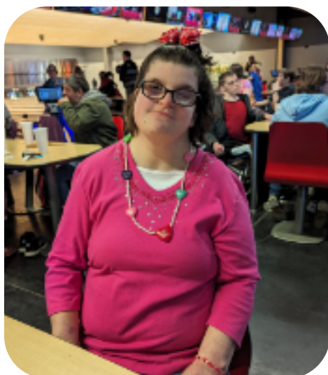
Happy Valentine's Day Birthday Girl!