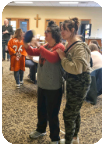
Games at the Chiefs Party!